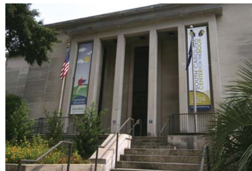
with the South Carolina Center for the Book.